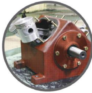
● Air end, fully optimized and designed to minimize Oil Mist and Blow By Gas.