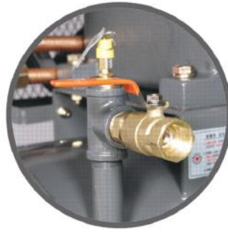
● Dual port: From users request air outlet directions can be modified.