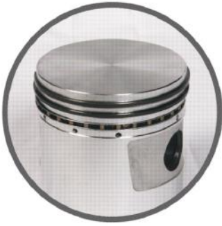
● KMC designed new piston ring and minimized oil consumption