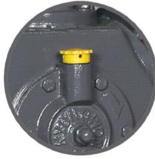
● Oil cap: Screw cap applied to prevent oil cap separation.