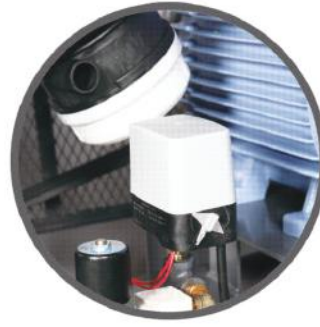
● Pressure Switch: Danfoss made 3 contact points (normal close).