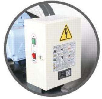
● Control box set up through user's line flow.